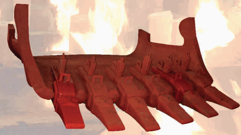
Dipper Front Wall