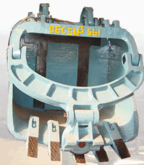
4.6/5 Cu. Mtr. Bucket