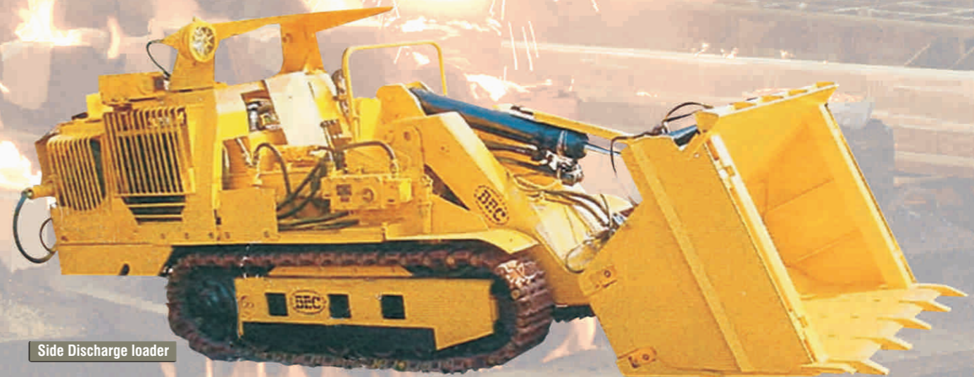
Side Discharge loader