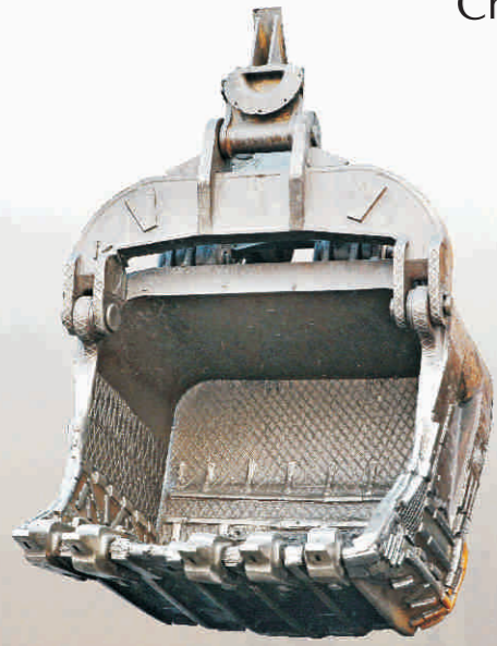
10 Cu. Mtr. Shovel Bucket

It is our mission and vision to develop different types of Machined Cast (Non-alloy Steel Castings, Alloy Steel Casting & High Manganese Steel Castings) items for Mining Sector. Our Qualified Engineers & Draftsmen are deputed to different mining sectors for the development of various items through reverse engineering. We have already developed and are supplying Bucket Assemblies for 4.6 Cu.M, 10 Cu. M and 20 Cu. M Shovels & Draglines. We have also manufactured and supplied Side Discharge Loaders & Feeder Breakers under Collaboration with Global Companies. We are also manufacturing and supplying spare of Buckets, Track Pads & Crawler Chain Assemblies, Bowl & Mantle Liners for Primary, Secondary & Tertiary Crushers and all are performing satisfactorily.