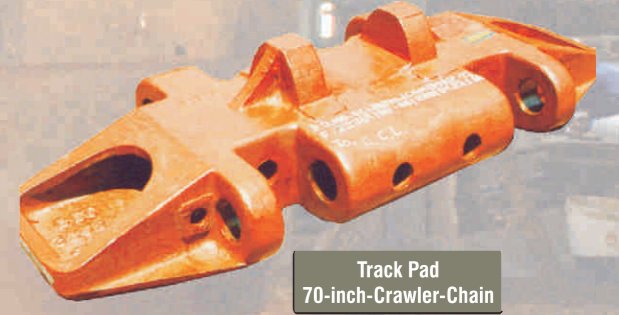
Track Pad 70-inch-Crawler-Chain