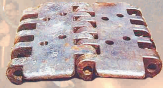
Track Pads in Assembled Conditions